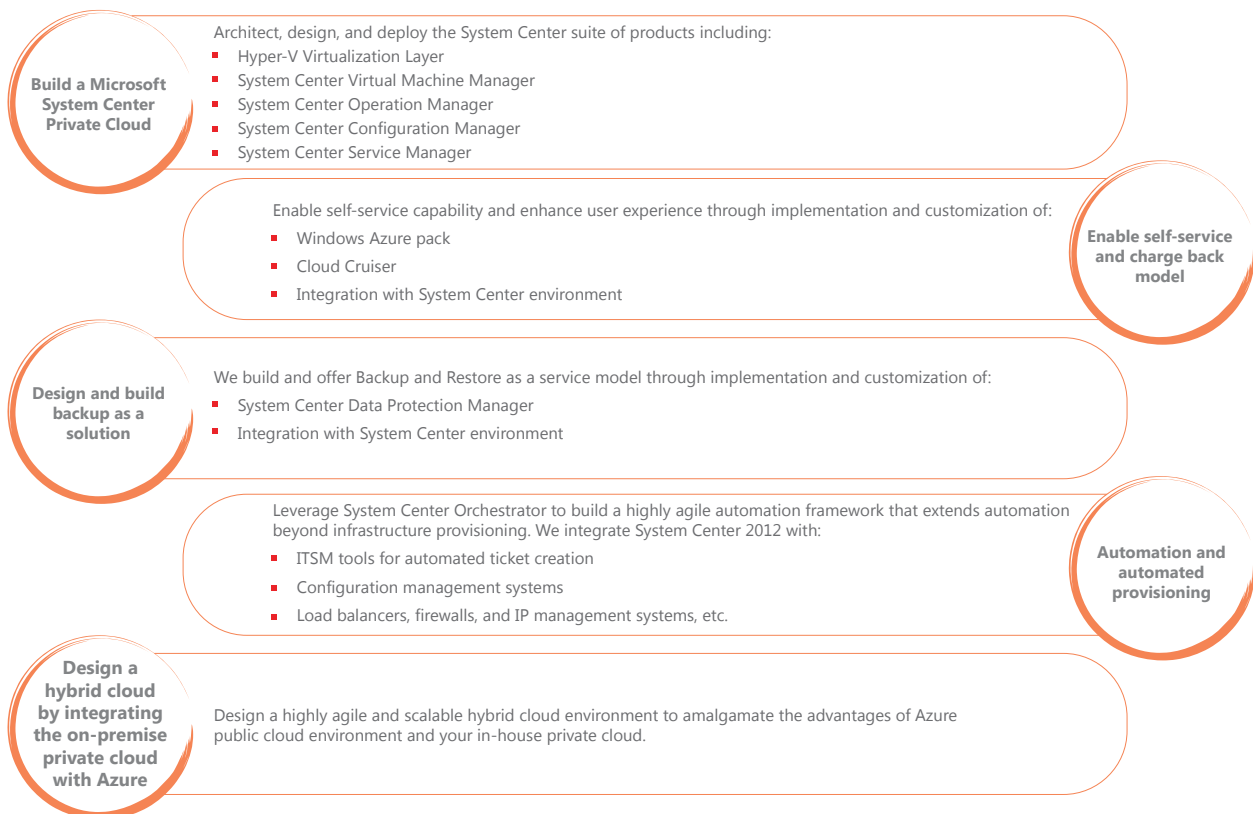
Figure 1: Microland's Microsoft System Center Integrated Service Offerings

simplify management of your cloud environment by leveraging Microsoft System Center suite of products.